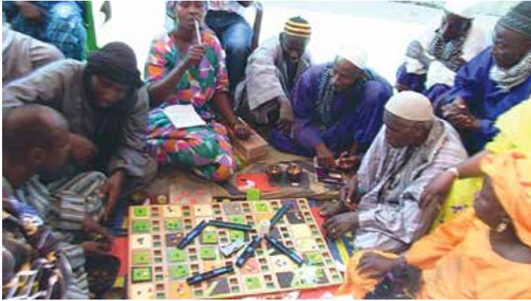
Photo 2. The platform is designed to enable complex foresight simulations based on simple modelling elements that anyone can use.

In the late 2000s, the simulation tool was improved so that it could be used on a large scale in multiple communities within a country, thereby enabling its national use for collaborative policy making (land reforms, environmental codes, sector organisation, etc.).